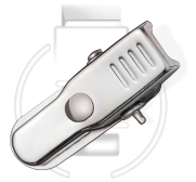
360° Swivel Alligator Clip Back

--- CHROMA imprint area - - - POLYDOME safe line - - - LABEL ONLY safe line - - - TRIM line