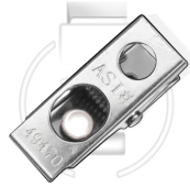
360° Swivel Bull Dog Clip Back

--- CHROMA imprint area - - - POLYDOME safe line - - - LABEL ONLY safe line - - - TRIM line